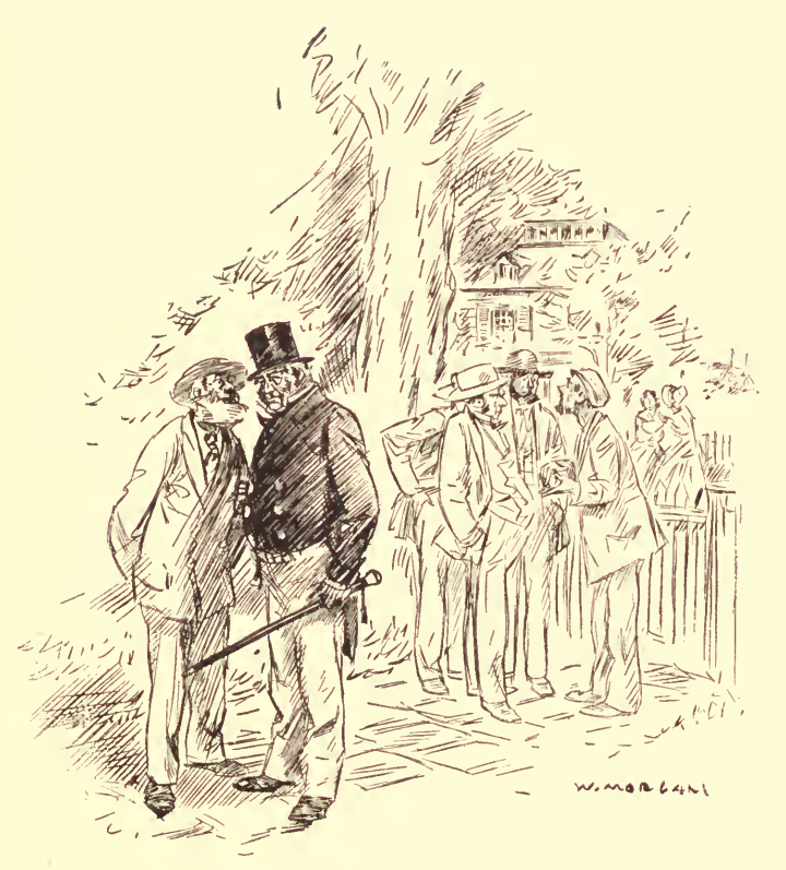
""He may be minister of the Regular church . . . but he'll never marry her, now."